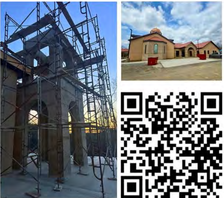
Image: Bell Tower