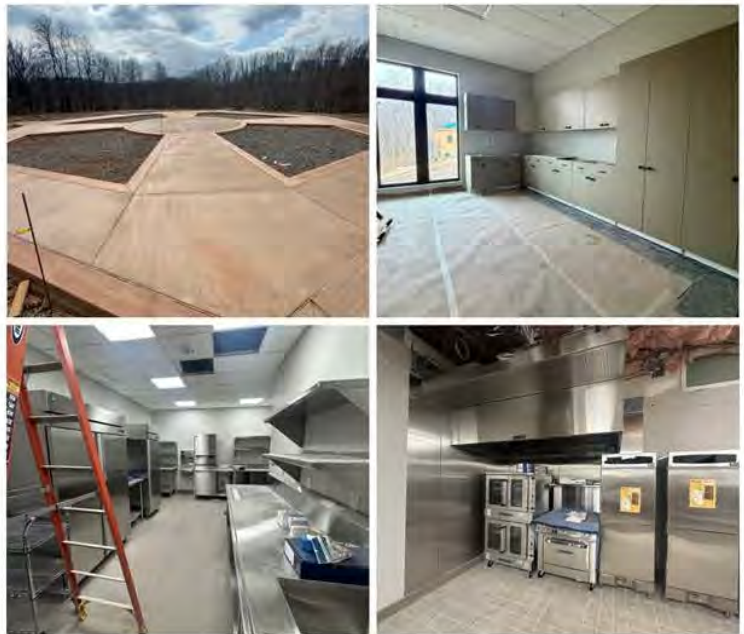
Images: Prayer Garden Walkway, Office, Kitchen