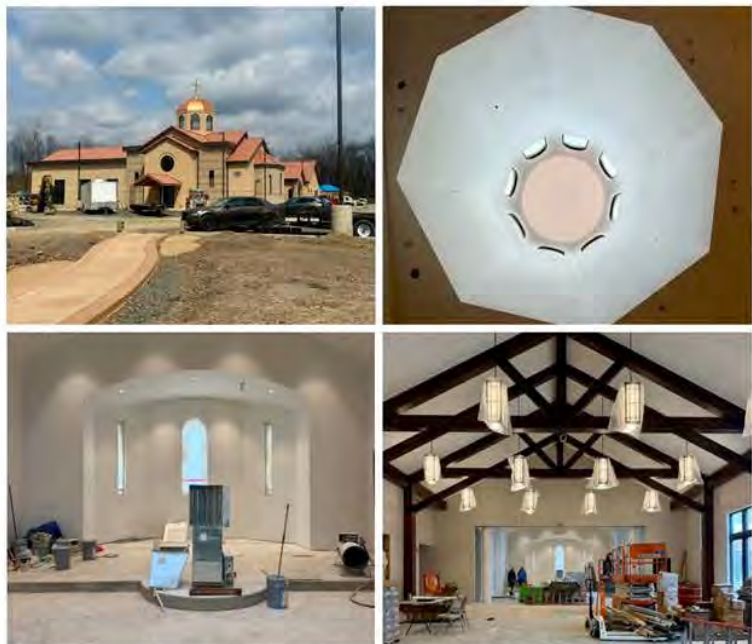
Images: Metropolis Center, Chapel Dome, Sanctuary, Social Hall

Did you receive our March mailing? Please consider a pledge or donation towards this worthy campaign that will benefit all. We are so close to our goal! To donate please scan the QR code or visit pittsburgh.goarch.org/pledge